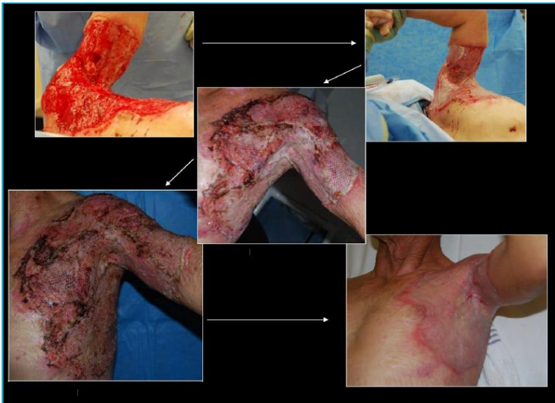
Graft take and reepithelialization over the course of 14 days (same timeline as above)